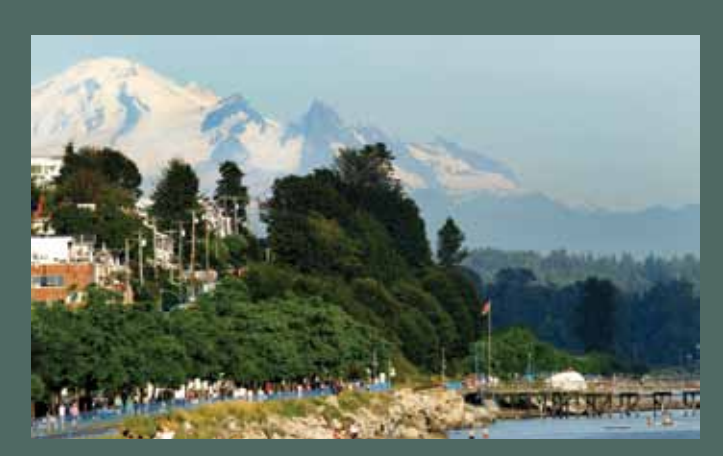
White Rock, BC

Throughout 2013-2014 West Coast worked with local governments and other authorities and experts to understand the specific challenges of planning for sea level rise, and analyzed models of regional governance from across Canada and other jurisdictions to identify options for cooperation across different levels of government. We are now collaborating with researchers at UBC to document the ecosystem services provided by coastal habitat to help lay the groundwork for regional collaboration to support coastal management and community resilience.